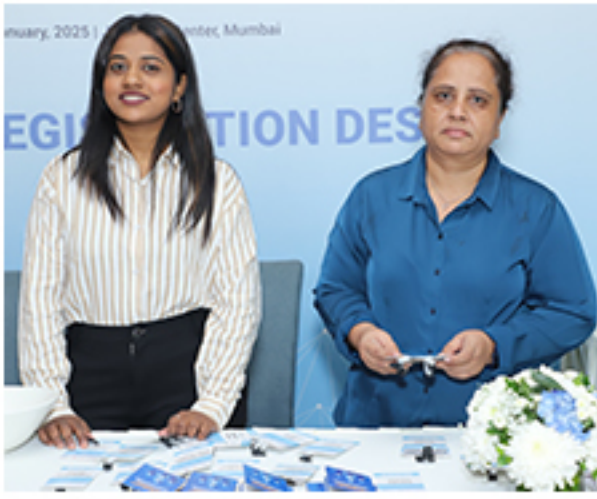
Registrations + High Tea