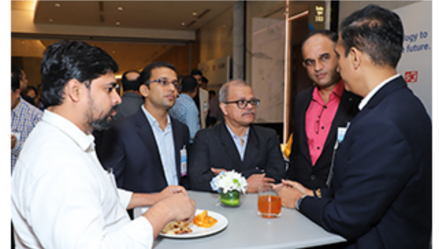
Delegates enjoying the networking dinner